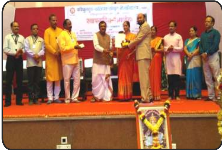
Best College Award 2019-20 (Category B.A. Civil Service)